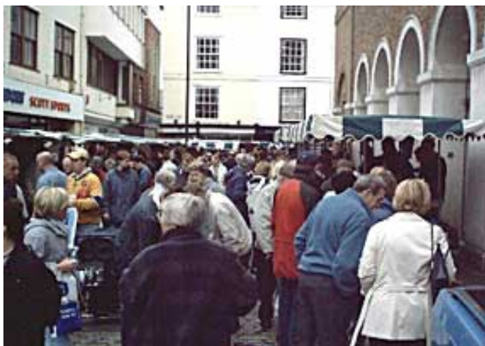
The first Hertfordshire Farmers Market takes place

Project contact: Carole Skidmore on 01992 531610 or carole.skidmore@eastherts.gov.uk