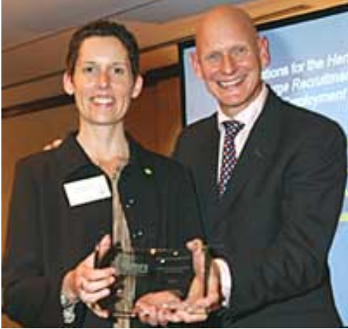
Nationwide Trust Limited wins the large business category sponsored by Hertfordshire Prosperity.